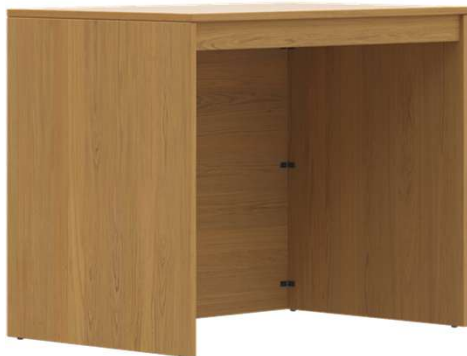
FR3YNP 24"d x 36"w x 30"h