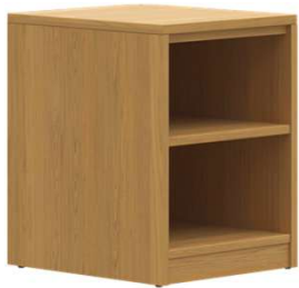
FR5-20 18"d x 15.75"w x 21"h