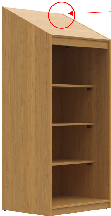
FR6ST-40 24"d x 30"w x 70"h