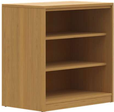
FR4A 24"d x 30"w x 30"h