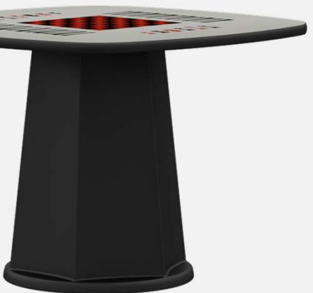
5006-42Q-GHPL 42"d x 42"w x 30" Squircle Game HPL