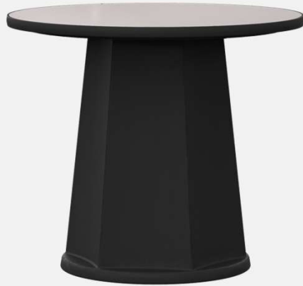
5006-36R-HPL 36" diameter x 30" Game HPL Available

ModuForm's unique and contemporary ModuMaxx cafe table invites patients and caregivers to connect and converse, helping to reduce stress, lift spirits, and boost cognitive function, all while fostering a warm sense of community and emotional support.