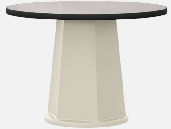
5006-42R-HPL 42" diameter x 30" Game HPL Available Shown in premium color Soothe

When promoting positive social interactions is key, the ModuMaxx collection of chairs and tables creates environments that soothe, inspire, and rejuvenate.