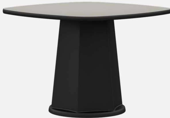
5006-42Q-HPL 42"d x 42"w x 30" Squircle Plain Top