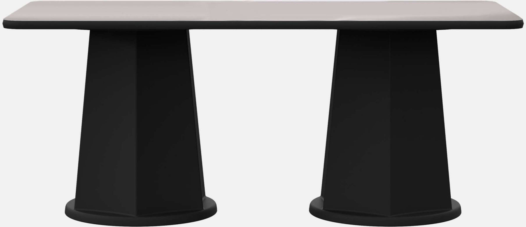
5006-3672-HPL 36"d x 72"w x 30"h Plain Top