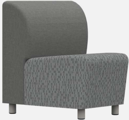
SF6222IA 29"d x 26.5"w x 32"h 18" Seat Height