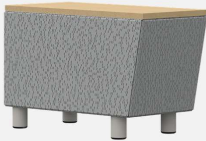
SF6200ET 24"d x 12"w x 16"h HPL Top