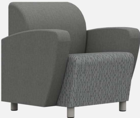
SF6201A 29"d x 30.5"w x 32"h 18" Seat Height