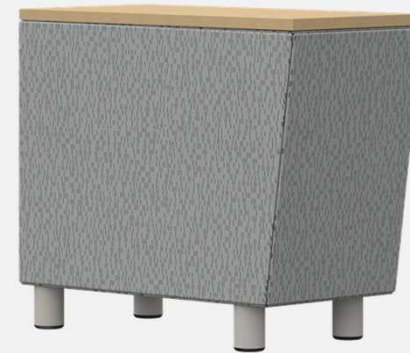
SF6200TET 24"d x 12"w x 21"h HPL Top