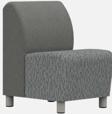
SF6201J 25"d x 18"w x 27"h 16" Seat Height