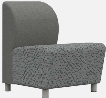
SF6222OA 29"d x 28"w x 32"h 18" Seat Height