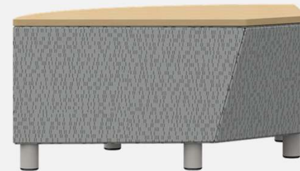
SF6290 27.25"d x 46"w x 16"h HPL Top