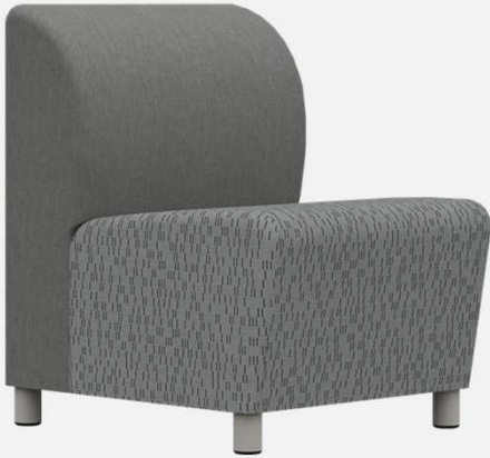
SF6201 29"d x 24.5"w x 32"h 18" Seat Height