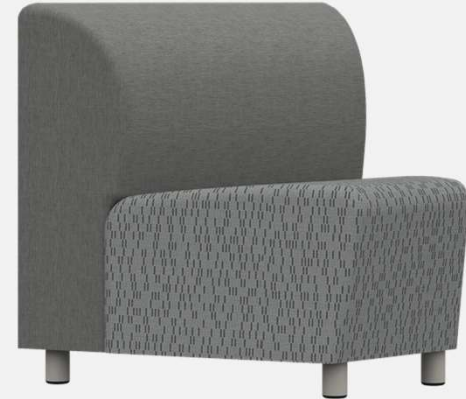
SF6245IA 29"d x 26.5"w x 32"h 18" Seat Height