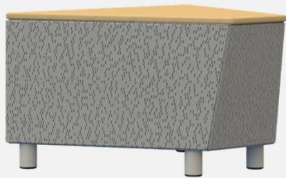
SF6245BNH 26"d x 32"w x 16"h HPL Top